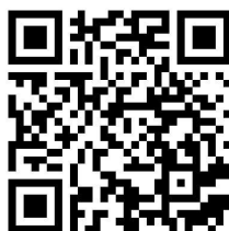
Top of the Rock

Although I like the view from newer buildings like Summit One Vanderbilt or The Edge, the iconic view from Top of the Rock is still my favorite - particularly enjoy the view on the green Central Park in summer.